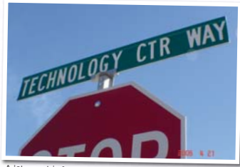
A jobs-centric focus would likely include higher contrast between residential and commercial development areas in Cheney.