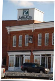
Adaptive re-use and new construction housing primary-sector businesses could help define Cheney's downtown.