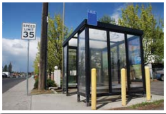
Transportation for goods and services - especially rail, auto and air - would become a top-priority under this scenario.